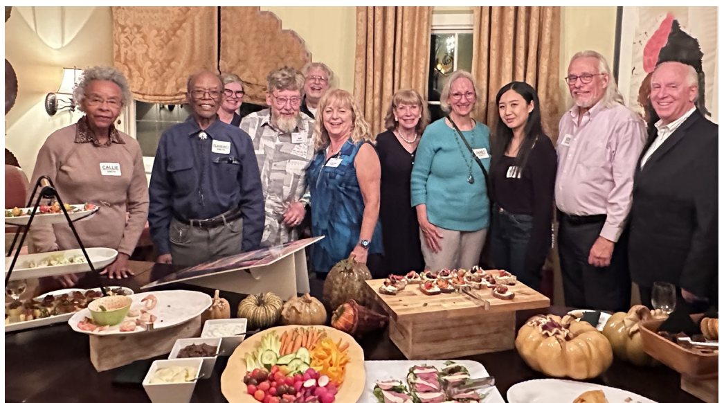
Major Donor Recognition Event, November 2023

The impact we’re making is remarkably inspiring. There is a “Donate” button on our webpage to make it easy for our members to make donations online. If each of our members donated to one of our resource development projects, it would have a dramatic effect on our community. While some donors wish to remain anonymous, RS believes that recognition encourages participation and camaraderie.