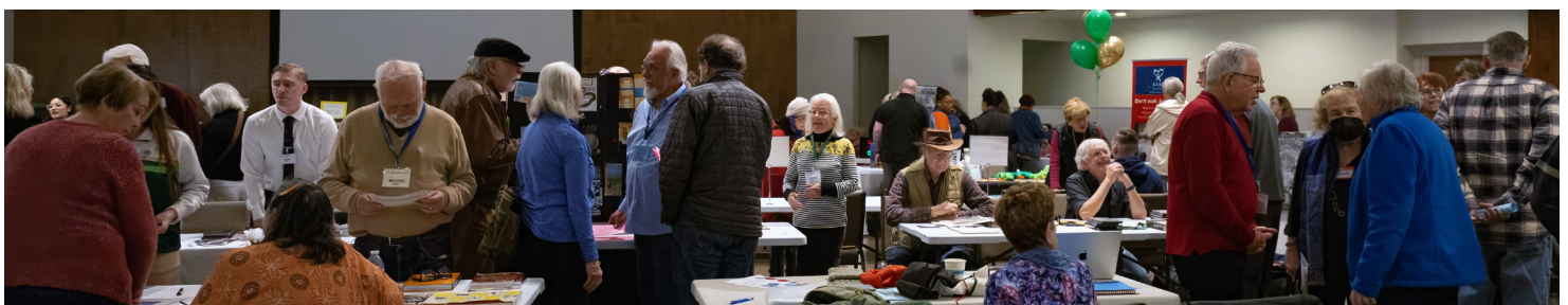
January 2024 Open House at Unitarian Universalist Society of Sacramento

Membership is much more than numbers. It includes providing support for our members when they renew and when they enroll in programs. We provided Fall and Spring Orientation for new members and Open House events featuring presenters, and provided both on-campus and community organizations an opportunity to showcase their organizations. We were able to show our new and returning members our enthusiasm for our programs and introduce new members to on-campus services such as the Cardiovascular Wellness, Physical Therapy and Audiology services provided to RS members.