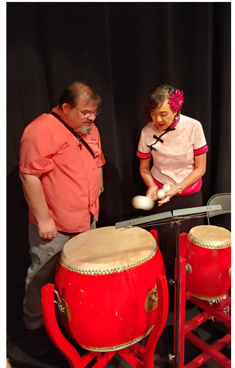
Capitol Chinese Orchestra