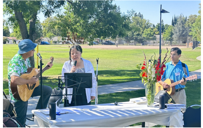
Musicians at Mexican Independence Day Social

We celebrated September 17, Mexican Independence Day at Arden Park. This event celebrated our return to Fall semester classes and paid honor to Hispanic-Latinx Heritage Month. 75 members ate, drank, chatted and listened to music – a good way to celebrate returning to classes.