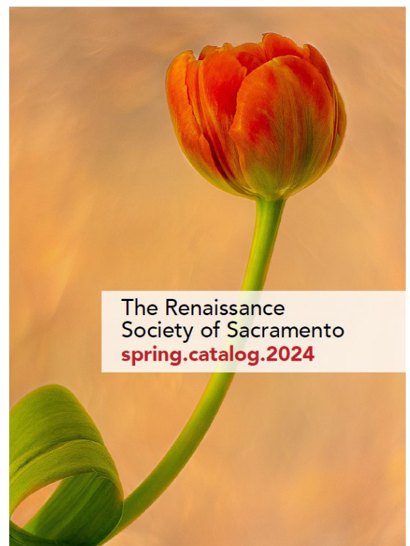
The Renaissance Society of Sacramento spring.catalog.2024

We published two illustrated semester catalogs as digital flipbooks, filled with course descriptions and leader profiles. We also published a calendar format schedule (At-A-Glance) that our members could use to select programs based on date, time, location, and delivery format.