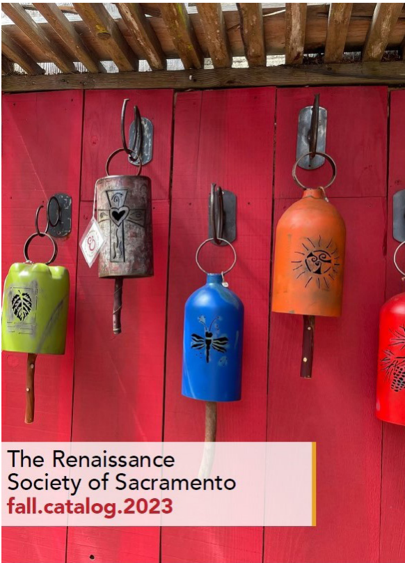
The Renaissance Society of Sacramento fall.catalog.2023

The Renaissance Society expanded how members could participate in and attend programs. In addition to offering programs in person, on Zoom, and hybrid, Program Leaders also offered walk-in programs. Walk-in programs enabled members who had not previously signed up for a class to walk into these designated programs to find a seat on a first come, first served basis.