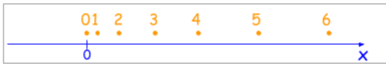
Motion diagram for student 4