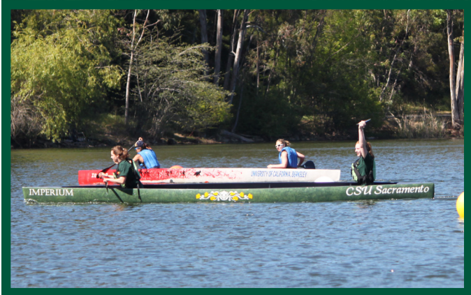
Above and below, the Concrete Canoe team; at right, the Steel Bridge team.

last year, under ASCE rules the second-place regional winner gets the invitation to the national level. The national competition took place at the University of Illinois campus at Urbana-Champaign in late June.