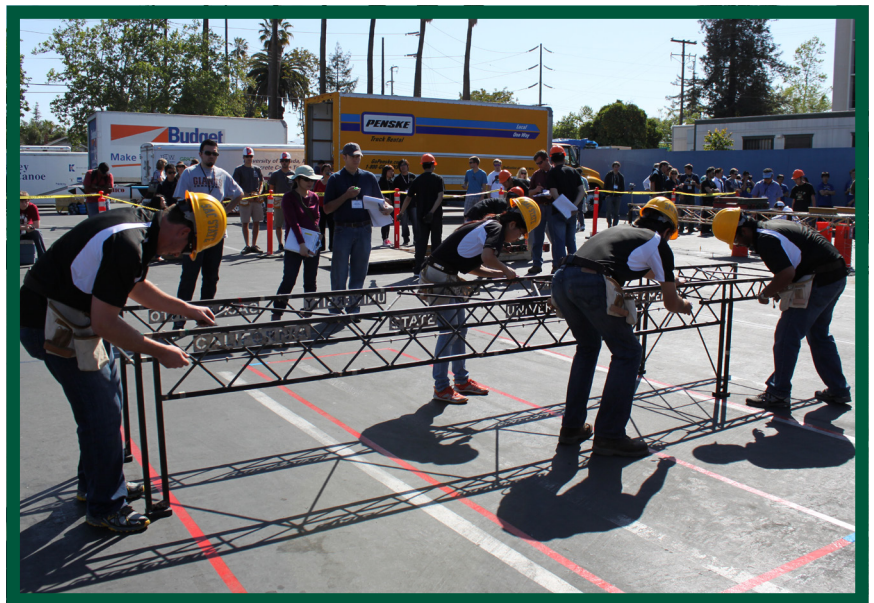
The Steel Bridge team with their Mid-Pac project.

Although UC Berkeley beat the Imperium in the rerun of the race, it was not enough to keep Sacramento from coming in second overall. Since UNR placed in the Top 5 at the Nationals