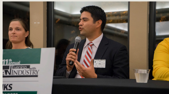
All five panelists are featured in Alumni News & Notes beginning on page 17.

"Don't be afraid to ask about project expectations regarding budget. Be frank."