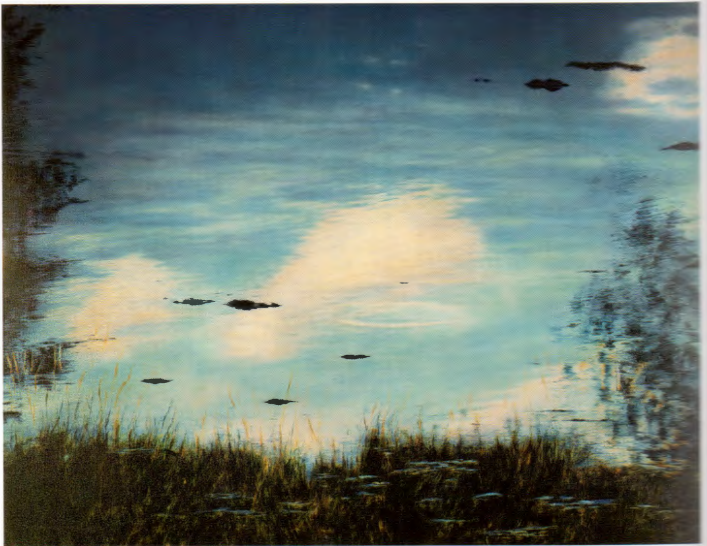
William Allan Colorado Pond-Blue , 1993 oil on canvas 54 x 70 inches Collection of Mary Keesling